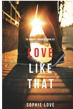
LOVE LIKE THAT (The Romance Chronicles—Book 2)